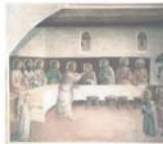
"This is the Lamb of God who takes away the sins of the world. Happy are we who are called to His supper." From the Holy Mass

Sunday, September 10, 2017 at 11 a.m. Cathedral of Saint Joseph, Hartford All faiths are welcome • www.archdioceseofhartford.org