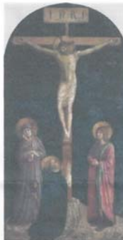
COME WITH US AS WE FOLLOW IN THE FOOTSTEPS OF ST. DOMINIC TOWARD JESUS THROUGH A LIFE OF PRAYER, STUDY, COMMUNITY, AND SERVICE. OUR MISSION IS THE QUEST FOR HOLINESS AND THE SALVATION OF SOULS.