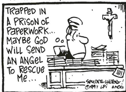
PETER AND PAUL, APOSTLES

Excerpts from the Lectionary for Mass ©2001, 1998, 1970 CCD.