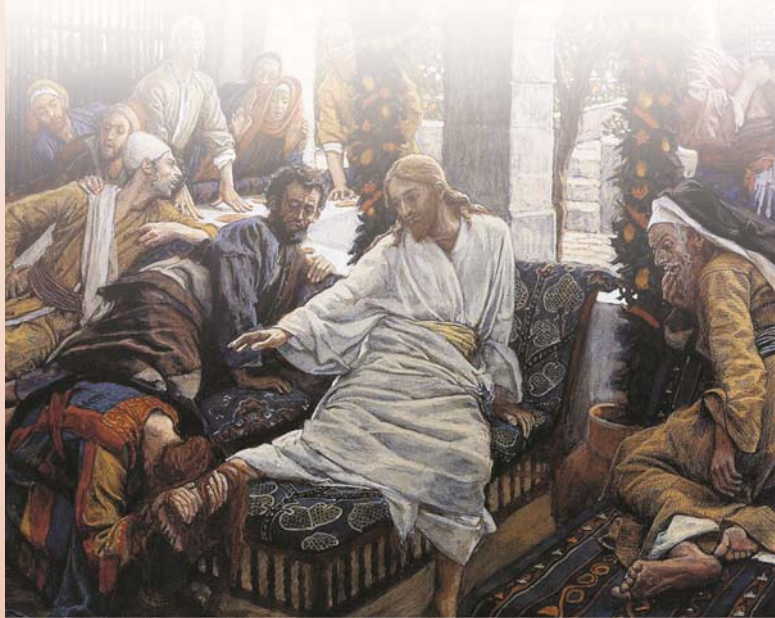
Excerpts from the Lectionary for Mass © 2001, 1998, 1970 CCD. Cover Design © Liturgical Publications Inc. | Photo ©Magdalenes Box of Very Precious Ointment, Tissot, www.restoretraditions.com